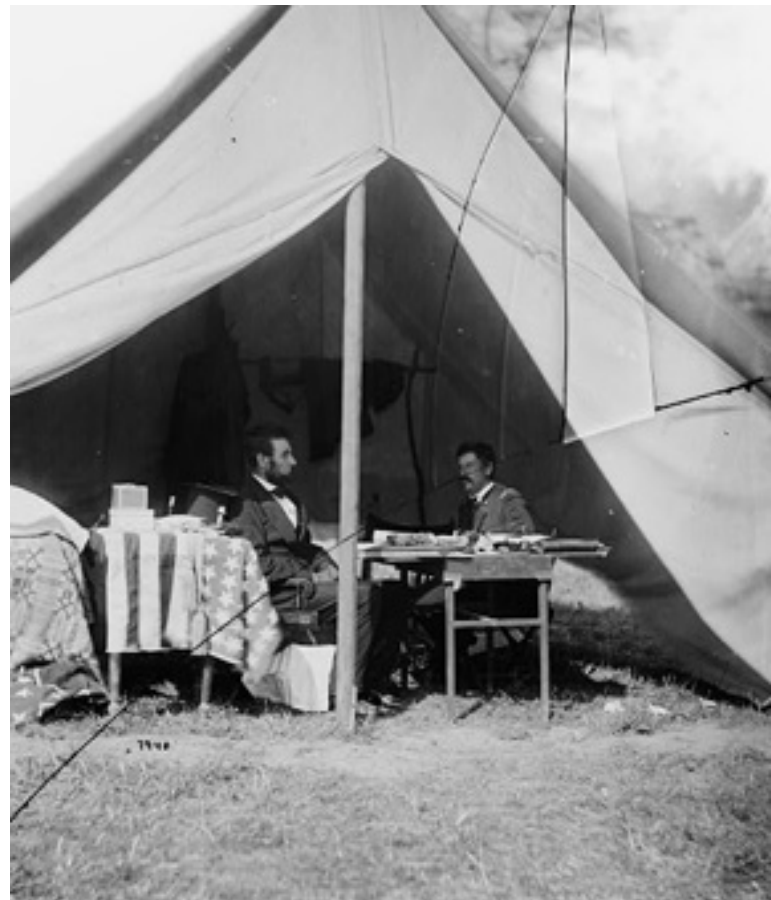
Lincoln and McClellan Antietam battlefield