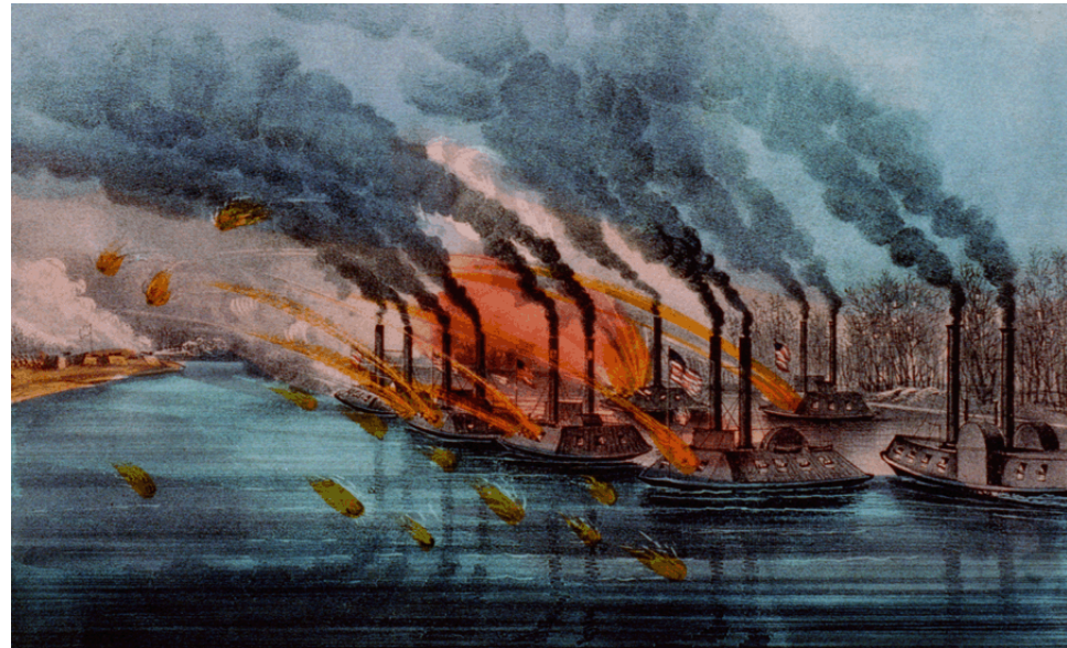
Battle of Fort Henry Gunboats fire from the Tennessee River