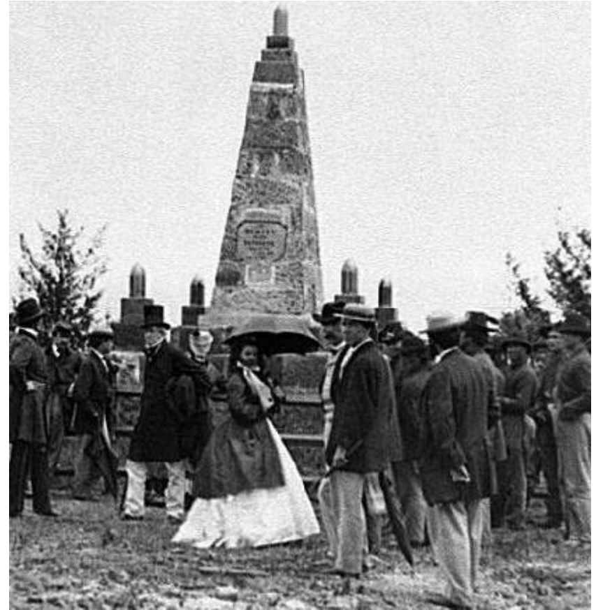
Dedication of Bull Run memorial June 10, 1865