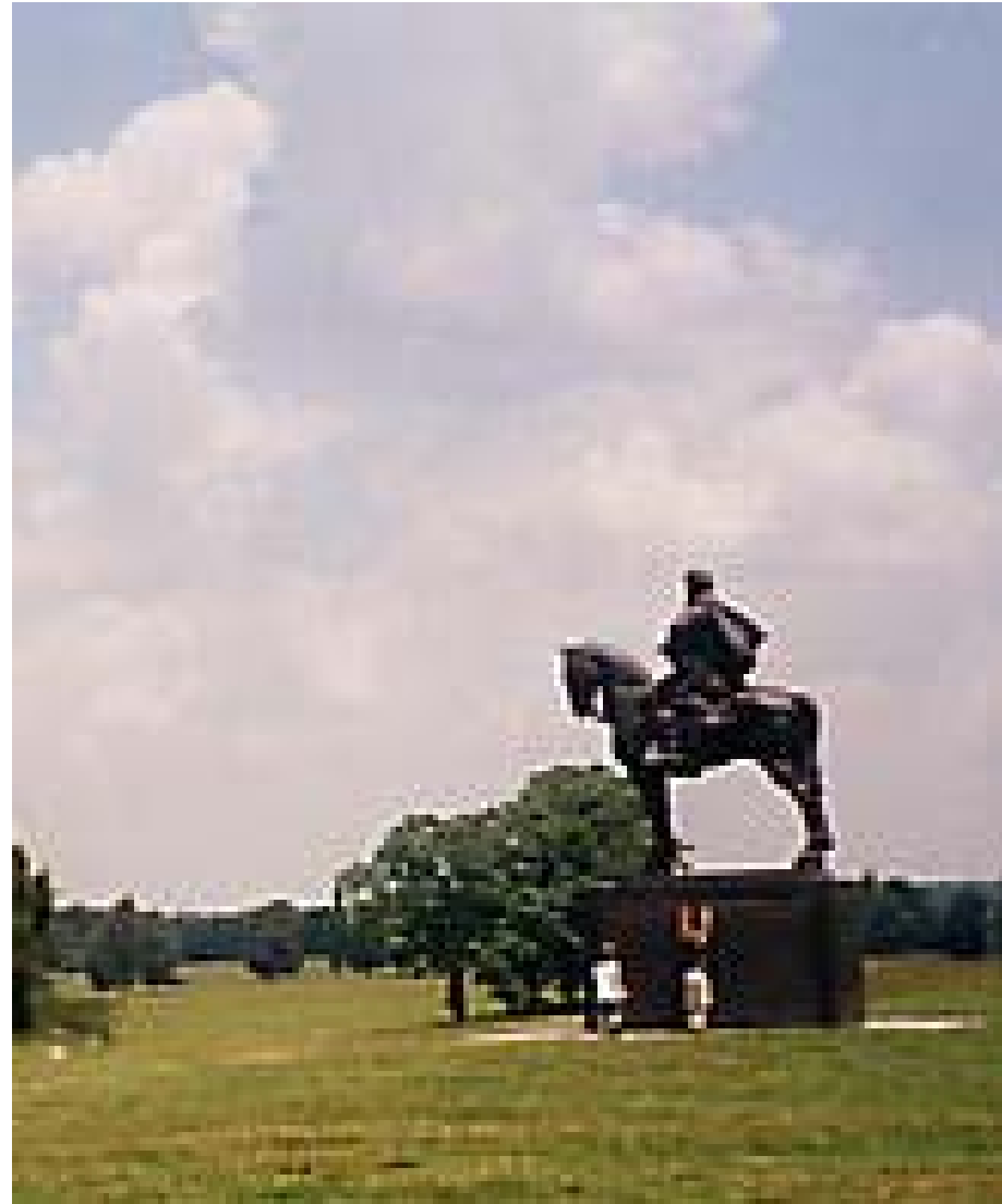
Monument to Stonewall Jackson Manassas, VA