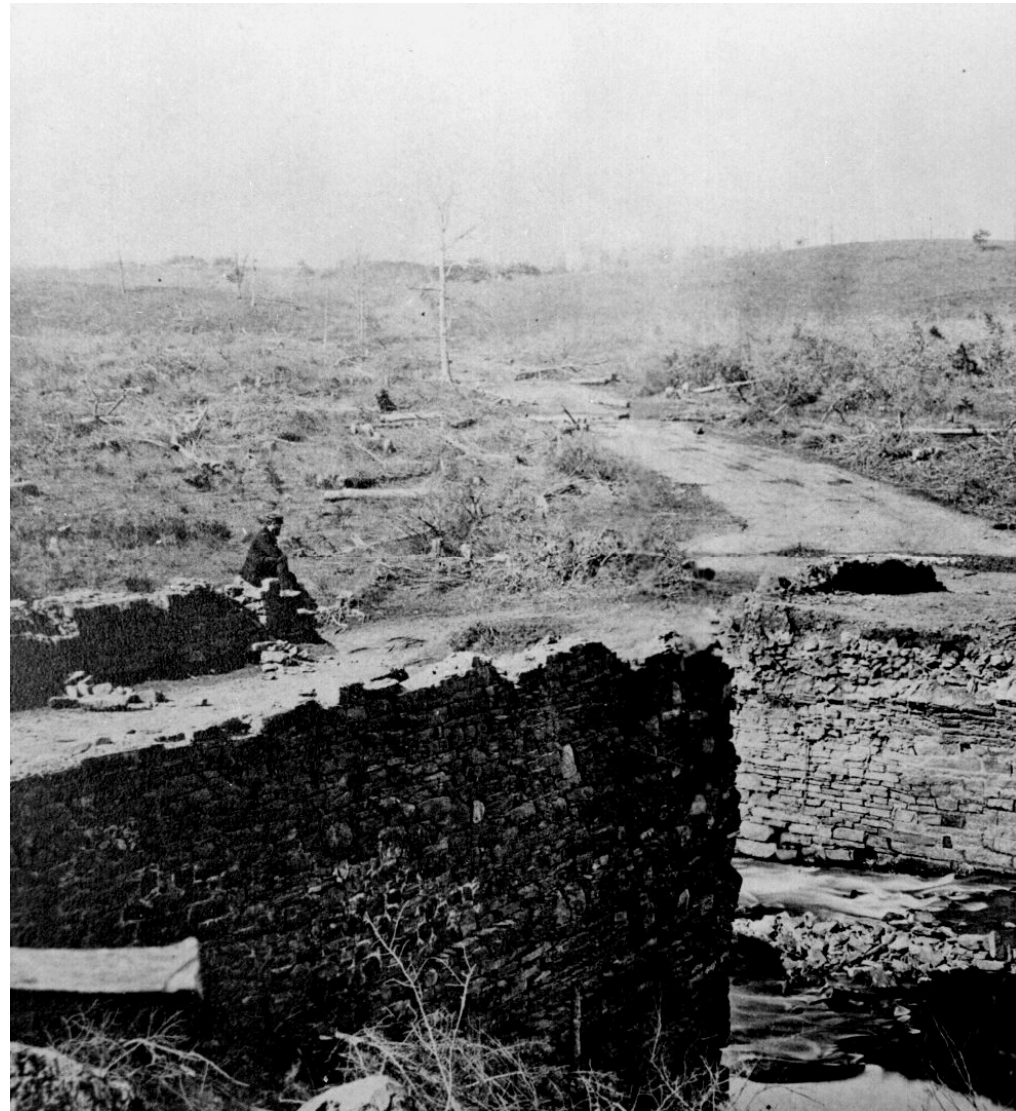
Broken bridge over Bull Run Outside Manassas, VA