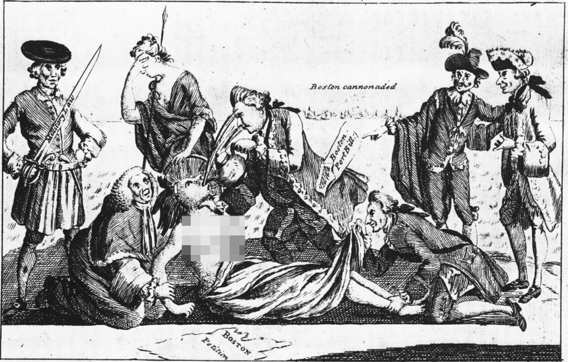
The able Doctor, or America swallowing the Bitter Draught.